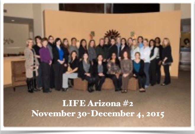
LIFE Arizona #2 November 30-December 4, 2015