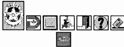
Figure 4. By Clicking on Individual Beats, Additional Detail Data Can Be Obtained